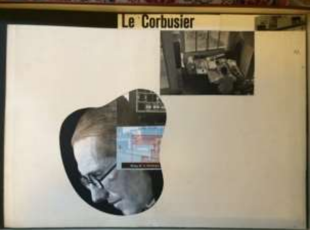
Cover (left), and section on Le Corbusier.