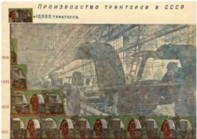
Examples from the collection of postcards: Growth of the working class, 1927-31 (left), and tractor production in the USSR.