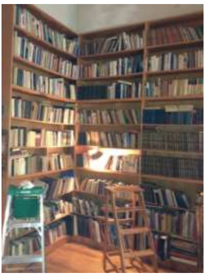
Part of the collection acquired by Columbia, prior to packing, in Brodsky's