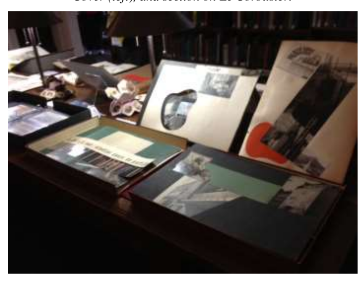
Studijní cesta do Pařiže on prominent display at the Avery's "new acquisitions" show in the Spring of 2014